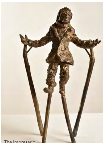
The Impresario by Edward Eustace

Tickets: £36 (inc. refreshment) Capacity: 60